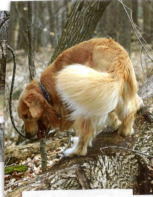
BALANCE AND 180 TURN

Parkour strengthens your relationship with your dog and builds confidence.